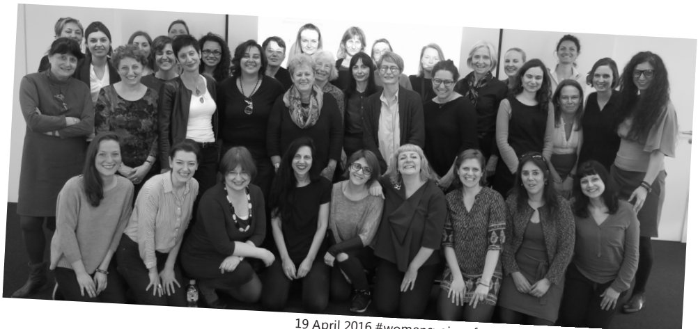
19 April 2016 #womensvoices forum

Let’s shift from a culture of disbelief and conflict to an assumption of belief and a culture of protection and peace! Together, we can build real peace for women and girls!